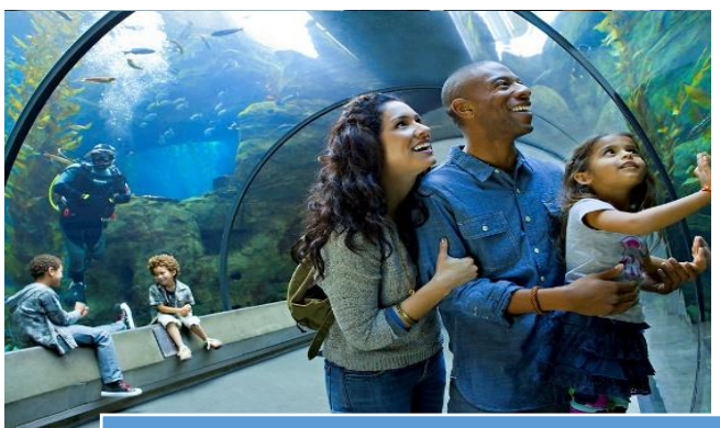
The California Science Center Foundation received a 501(c)(3) Bond